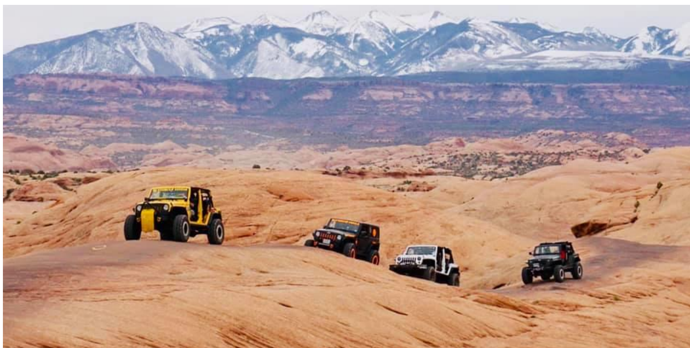
Moab Vista

Next meeting ~ June 3rd, at 7:00pm at the Clubhouse ~11850 S Highway 191, Unit B10